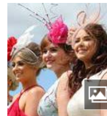
Down Royal summer festival June 24 [Photos]