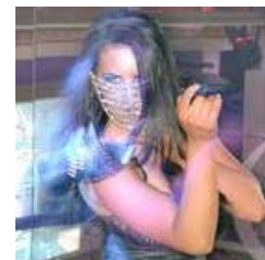
Drug mule McCollum misses out on £100k payday